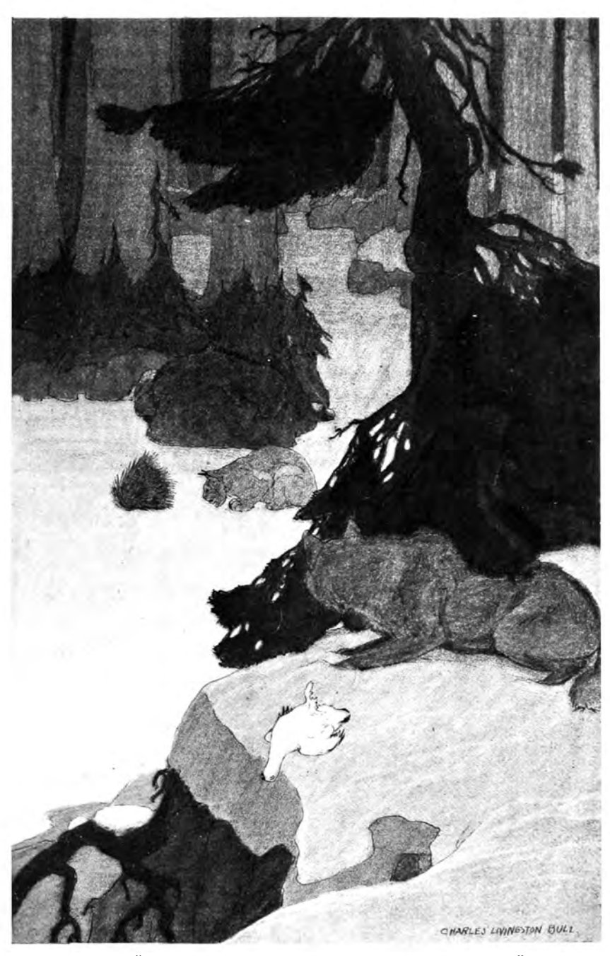
"HE WATCHED THE PLAY OF LIFE BEFORE HIM."